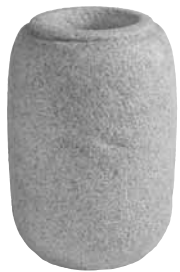
Sagada Pot Pot Sagada Sagada-Vase Maceta estilo Sagada (PT-1101)