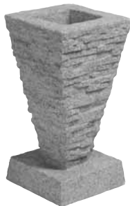
Saqqara Fountain Fontaine Saqqara Saqqara-Springbrunnen Fuente estilo Saqqara (PT-1110)

Recommended pump: 200 U.S. GPH (757 LPH) Pompe recommandée : 757 L/h (200 gal US) Empfohlene Pumpe: 757 LPH Bomba recomendada: 200 gal. EUA por hora (757 l/h)