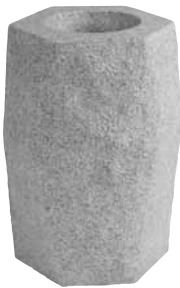
Foaming Rock Roche moussante Schwammstein Roca porosa (PT-1100)